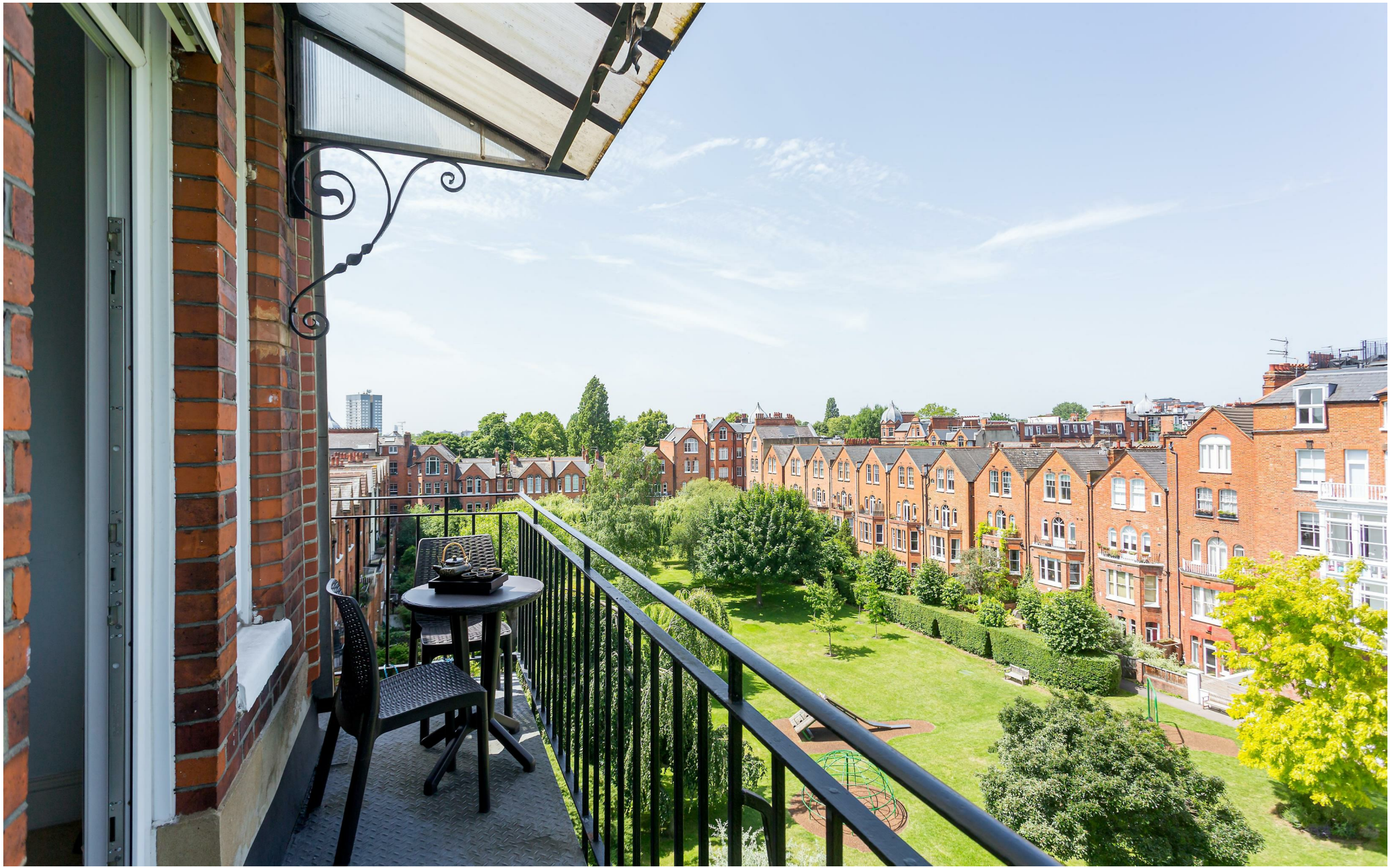
Greencroft Gardens NW6